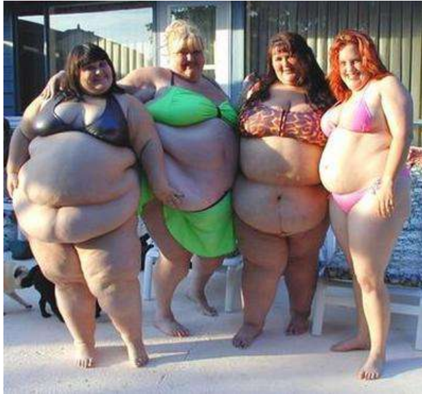
Chocolate can cause SMALL FEET! Warn everyone!

It seems as though nothing is safe to eat anymore. This is what happens when you eat chocolate! THIS IS A MEDICAL WARNING! It could happen to you, your family and friends!